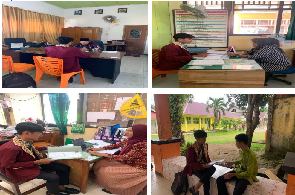
Figure 1. Interview session with the informants

“I encourage students to respect differences by helping them understand that everyone has different backgrounds and opinions. During class discussions, I also remind students to respect their classmates' views.”