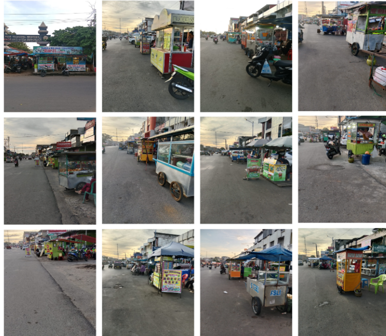
Figure 1. Business Activities of MSMEs at Panorama Market Street, Bengkulu

A mixed-methods approach combining qualitative and quantitative techniques was used to provide a comprehensive understanding of MSME owners' perspectives on halal labeling. This method enables the comparison of objective statistical data with subjective perceptions. Data was collected through a combination of non-participant observation, surveys, and semi-structured interviews. Observations were conducted in a natural and informal manner along Panorama Market Street. Additionally, questionnaires were distributed to 100 MSME owners, with 75 valid responses collected and analyzed, while the remaining were excluded due to incompleteness or invalid data. The interview, as the last one, engaged 20 MSME owners selected for in-depth, semi-structured interviews. These were conducted over four months, totaling over 255 hours, with a focus on exploring MSME owners' rejection of halal labeling and its contestation.