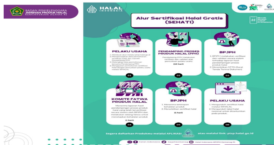
Figure 2. The flow of halal certification through SEHATI apps

In a wider scope, the process of halal certification is as follow: